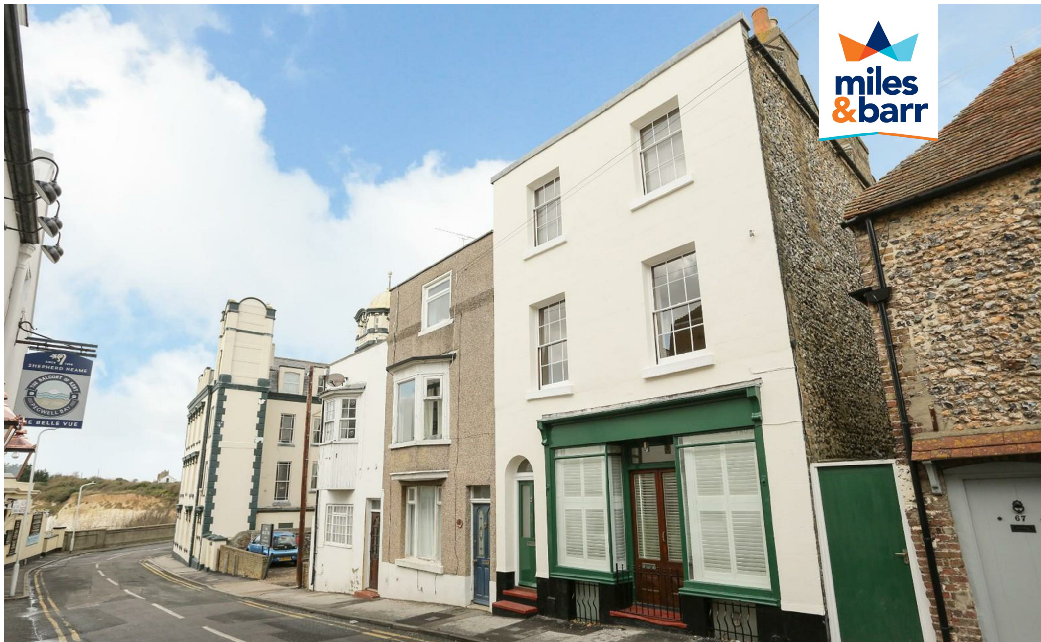
THE PEAR TREE COTTAGE 69 PEGWELL ROAD RAMSGATE